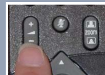
Tandberg Volume on your remote